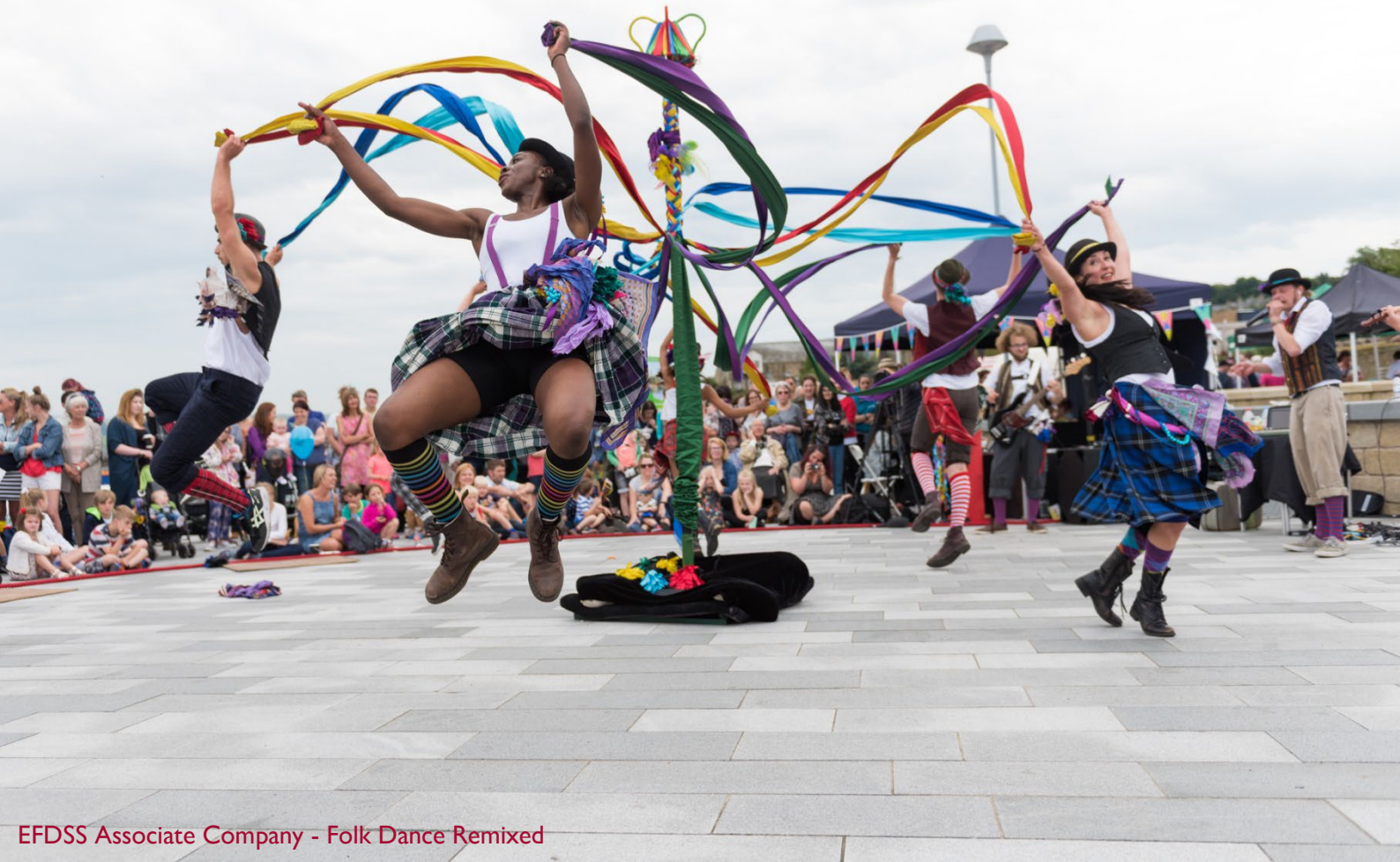
EFDSS Associate Company - Folk Dance Remixed