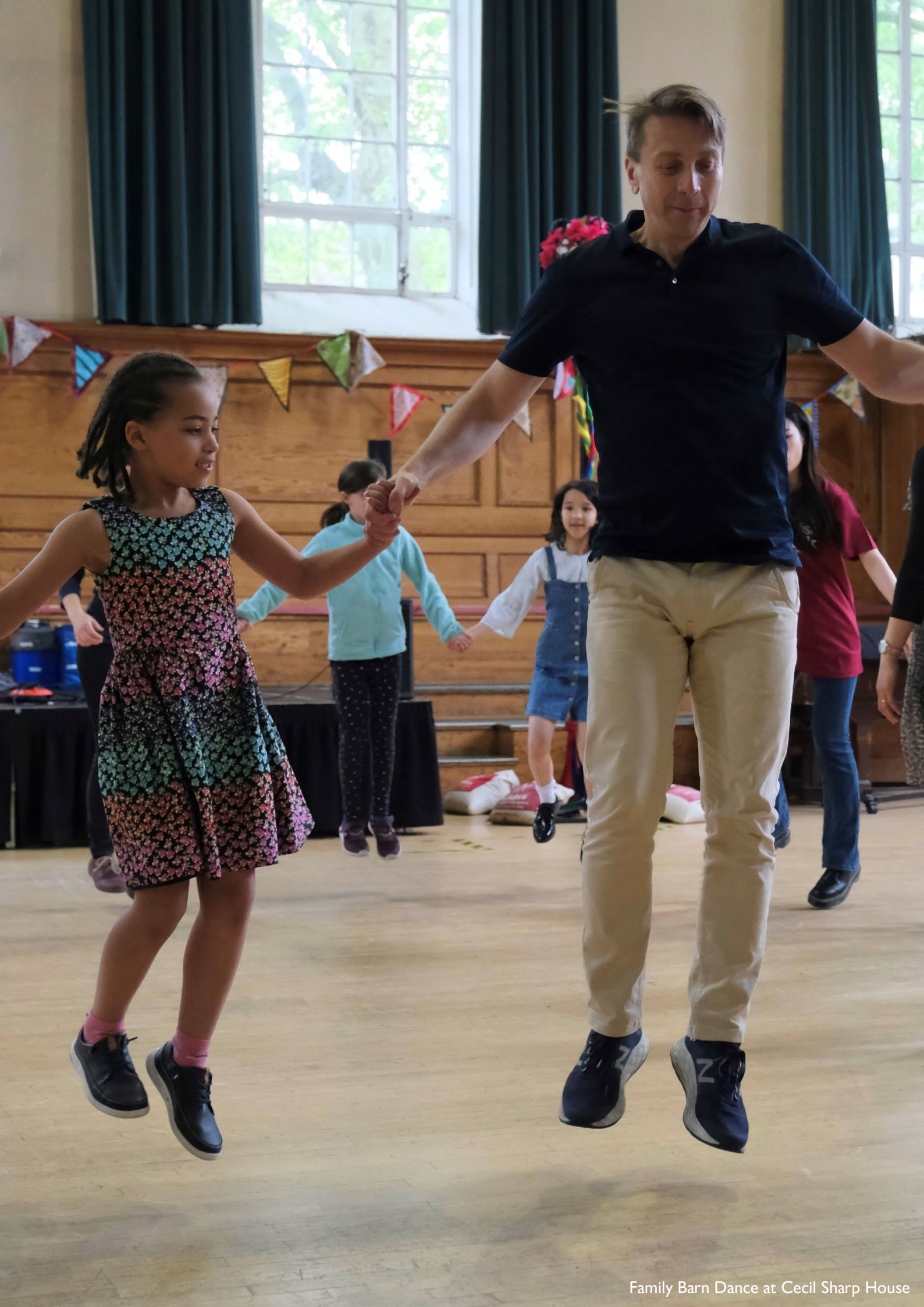
Family Barn Dance at Cecil Sharp House