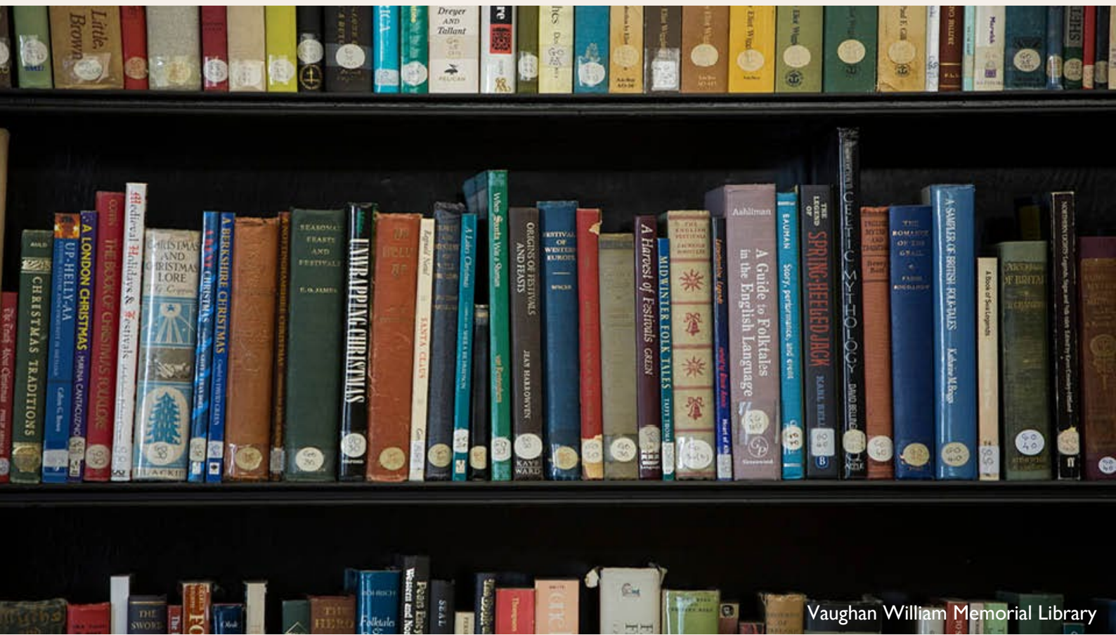
Vaughan William Memorial Library