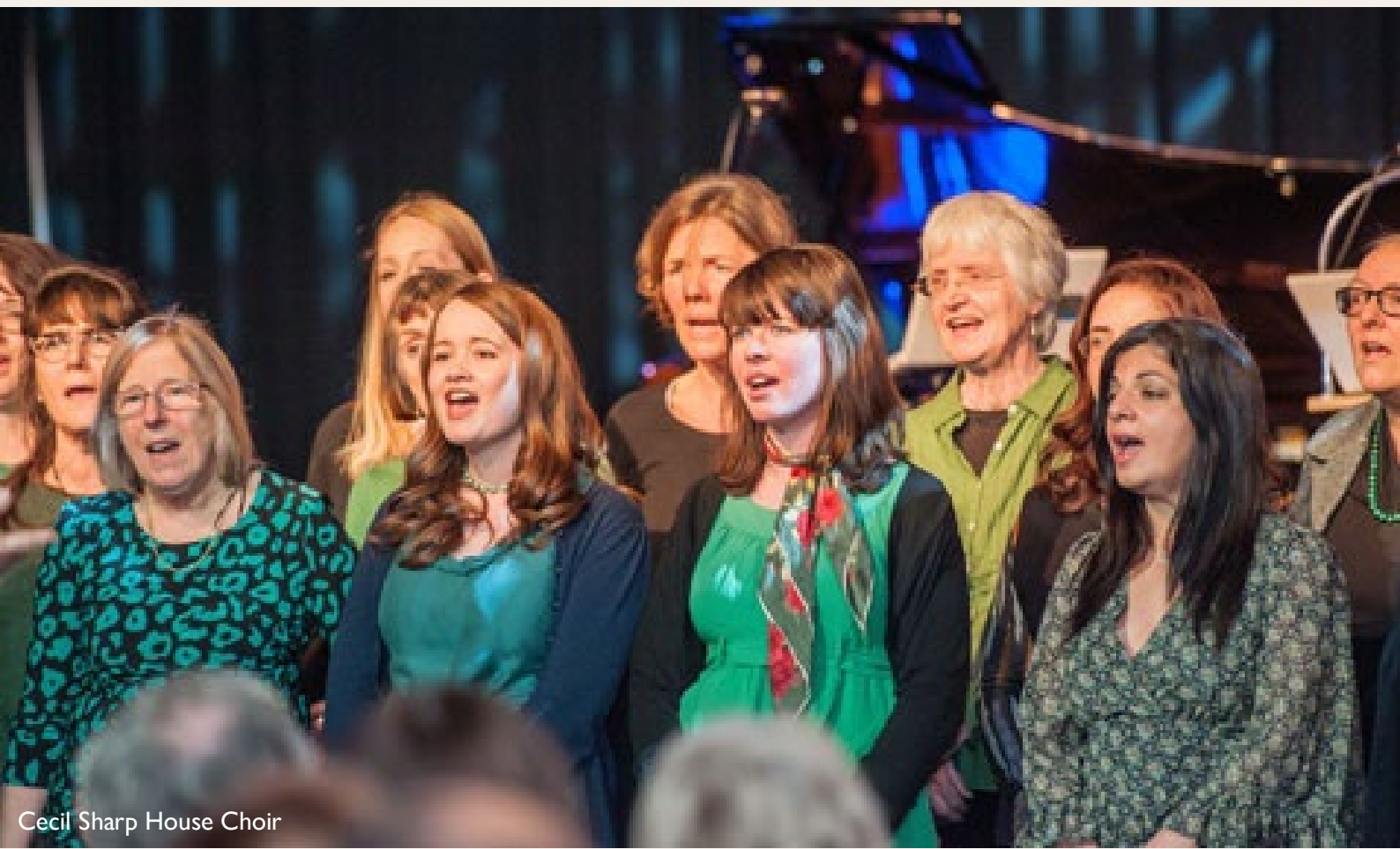
Cecil Sharp House Choir

https://www.efdss.org/about-us/who-we-are/board