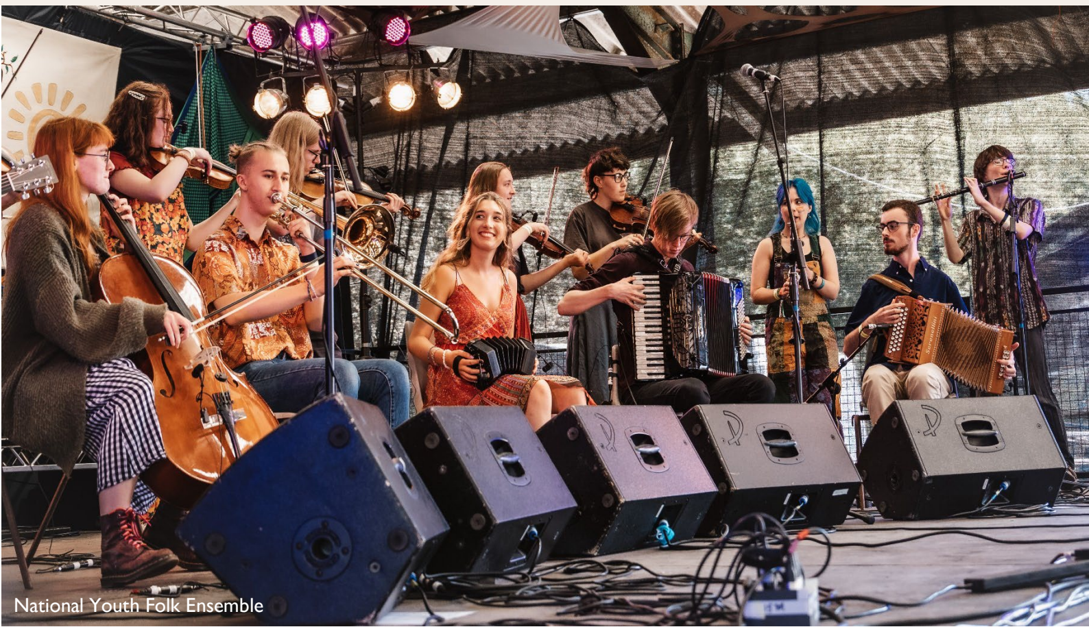
National Youth Folk Ensemble